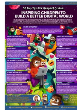
Inspiring Children to Build a Better Digital World